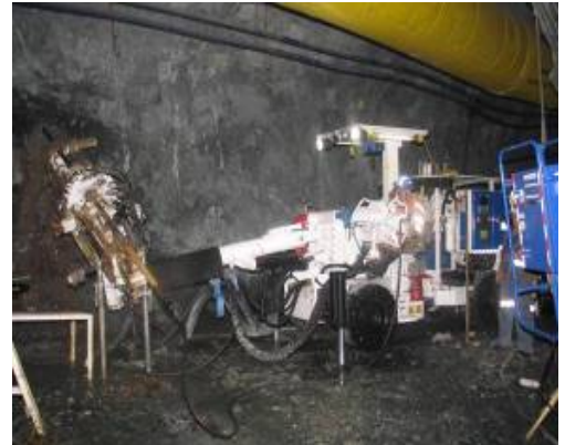
Diamond Drilling at Perseverance